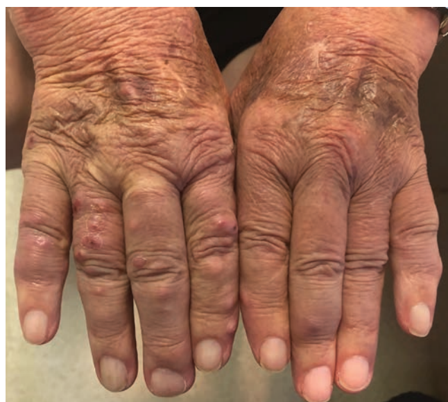
Figure 1. Multiple subcutaneous nodules on the fingers.

An 82-year-old man was referred with a 1-month history of multiple subcutaneous nodules on the fingers of both hands. He had a 13-year history of rheumatoid arthritis and had been on methotrexate 6 mg/week and prednisolone 10 mg/day. Physical examination revealed that vital signs were stable. There were multiple subcutaneous nodules on the fingers (Figure 1), both lower extremities, and the back, varying in consistency from soft to hard and in size up to 1 cm in diameter. Laboratory results showed a white blood cell count of 6200/mm 3 (reference range 3500-9800/mm 3 ), a C-reactive protein level of 2.18 mg/dL (reference range 0.00-0.14 mg/dL), a blood glucose level of 271 mg/dL (reference range 70-110 mg/dL), and a hemoglobin A1c level of 9.4% (reference range 4.6-6.2%). Needle aspiration of a soft nodule on the right hand yielded purulent fluid. On Ziehl-Neelsen staining of the fluid, numerous acid-fast