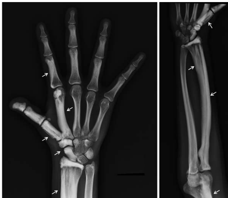
Figure 1. Radiography of the right upper limb showing extensive osteoma-like lesions. Arrows indicate the main areas of melorheostosis.