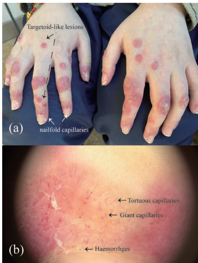
Figure. (a) Typical targetoid-like lesions and (b) obvious nailfold capillaries in both hands.