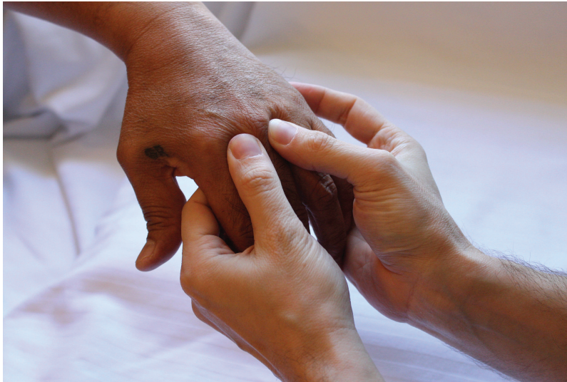
Figure 1. The 2-finger technique was performed by palpating the MCP while flexed at about 45°. The medial and lateral side of the joint were palpated simultaneously by the thumbs of each hand. MCP: metacarpophalangeal joints.