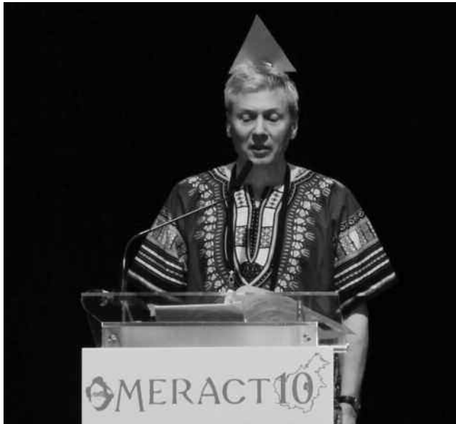
Figure 1. John Kirwan addressing an OMERACT 10 plenary session.

may require insight from both clinicians and patients. For example, the need to prevent the development and progression of erosions in rheumatoid arthritis is an outcome that would not be obvious to patients, whose experience is focused around the symptoms of inflammation.