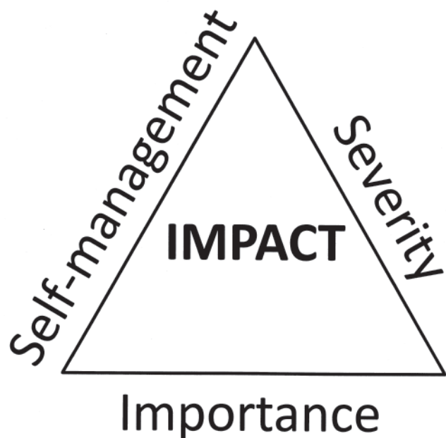
Figure 3. The impact triad incorporating severity, importance, and self-management as 3 aspects of the overall impact of a condition on a patient. These aspects may be broadly equated with symptoms, psychology, and environment in Figure 2.

offer patients a more clear understanding of what might happen to them personally if they take the treatment. This issue was explored in the workshop on response criteria and the importance of change 11 . When interpreting scores at the individual level, 4 main concepts need to be taken into account: improvement; status of well-being; onset of action; and sustainability. As the full report of that workshop proclaims — information from clinical trials on how many patients showed a response, what the level of response was, how quickly they improved, and how many patients are doing well over time, would be extremely useful — for patients and physicians alike 11 .