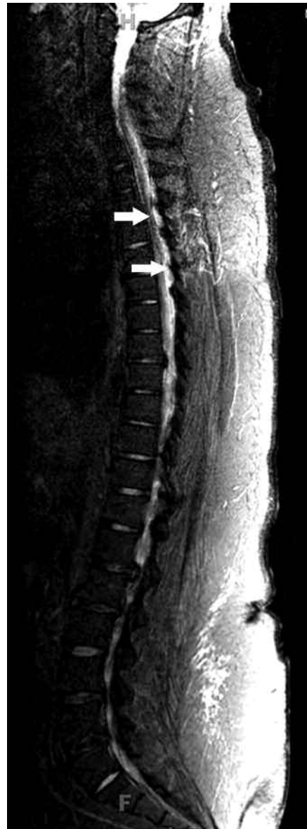
Figure 1. T2 short-tau inversion recovery MRI of the cervical spine without contrast. Arrows outline area of cord compression from epidural fluid collection.

Radiographic findings of spinal gout include vertebral erosions, bone destruction causing joint subluxation, pathologic fractures, and osteophyte formation 4 . MRI findings include abnormal signals in T1- and T2-weighted images representing the gouty tophus 4 . However, these findings are nonspecific and can also be seen in cases of central nervous system infection. Histologic features of tophaceous gout include granuloma formation with histiocytes, fibroblasts, and multinucleated giant cells surrounding hypocellular amorphous material.