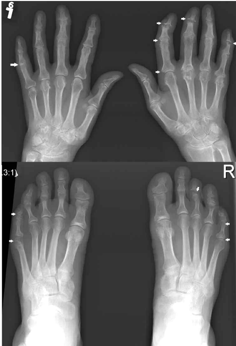
Figure 1. 2005: Severe radiographic joint damage prior to starting anti-TNF therapy; large erosions, pencil-in-cup deformity, and periostitis.

Radiographic assessments. Radiographs of the hands and feet were read by 3 observers by consensus using 3 methods: the modified Steinbrocker method, which is used in our clinic 2 ; the van der Heijde (vdH) modification of the Sharp methods 3 ; and the Ratingen scoring system 4 .