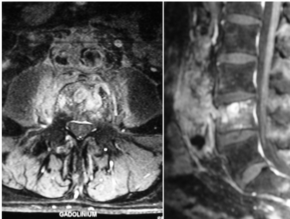
Figure 1. T1 MRI sequence with gadolinium injection shows high signal alteration in the L4 vertebral body and psoas muscles, suggesting a diagnosis of spondylitis, on both coronal (left) and sagittal (right) views.