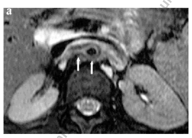
Figure 1 . A. Axial T2 weighted magnetic resonance image at the level of the renal arteries. Note the concentric wall thickening of the aorta and the renal arteries (arrows) with a hyperintense inner layer. B. Oblique view of 3D-reformatted contrast-enhanced MR angiography showing segmental high-grade stenoses of the renal arteries and the infrarenal aorta (arrows). The common iliac arteries are occluded bilaterally (arrows).

Baseline inflammatory activity indicated by C-reactive protein was increased. Magnetic resonance angiography revealed segmental high-grade stenoses of the renal arteries