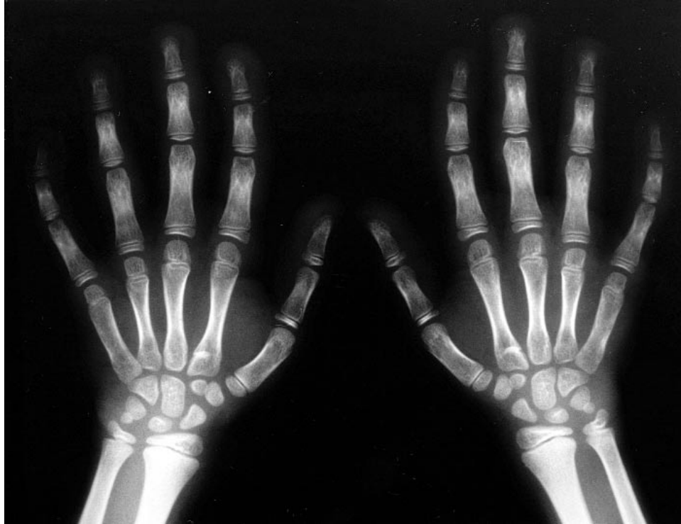
Figure 3. Patient's hand radiographs, age 10 years. Note the normal general aspect and normal bone age, with large interphalangeal articulations and deviation of the last phalanges of both 2nd fingers.

differential diagnosis, all the more because subcutaneous nodules and periorbital edema have been reported in SLE and LP, sometimes as the first clinical feature of the disease 8,9 . Nevertheless, these diseases were ruled out as neither the clinical description nor the pathological result in our patient was consistent with one of them.