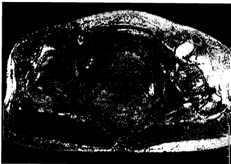
Figure 1. Axial T2 weighted MRI (2000/90) revealed the enlarged iliopsoas bursa at high intensity (arrow).