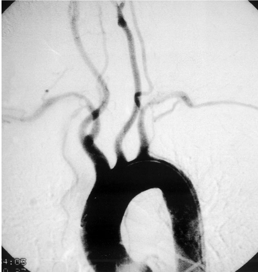
Figure 2. Angiogram in Patient 2 detailing bilateral subclavian artery stenoses.

phamide, her renal function continued to deteriorate and MRI/MR angiography revealed no change in the subclavian stenoses. Progressive renal failure was ascribed to her hypertension and underlying arteritis. Immunosuppressive therapy was discontinued in June 1999 and hemodialysis commenced 2 mo later. In September 1999, her HBsAb was negative. She successfully underwent living related renal transplantation in November 1999. The native kidneys were neither explanted nor biopsied at the time of transplant.