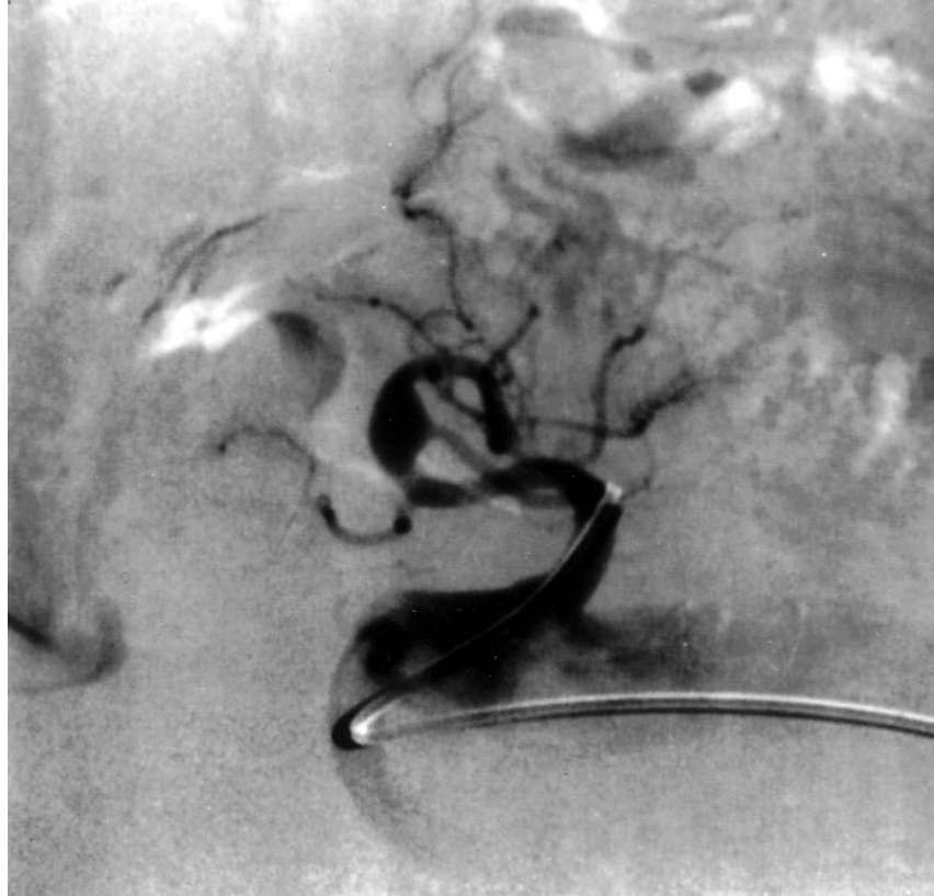
Figure 3. Digital subtraction imaging from selective catheterization of the left renal artery of Patient 2 showing fusiform dilatation of the renal artery visualized at the apex of the renal artery curve. Subtle irregularities and punctate accumulations of contrast suggestive of microaneurysm are seen in the branch vessels proximal to the large renal artery aneurysm.

mimic some of the renal artery changes seen in the second patient, can rarely involve the subclavian arteries, and is associated with a normal ESR 23 . However, the older age of our patient, the profound systemic symptoms (i.e., malaise, fatigue, anorexia), the documented improvement of the subclavian wave forms after prednisone, the rapid progression of the renal lesions, and the angiographic changes of the left renal artery would be atypical for that diagnosis 23 . Arteriosclerosis causes chiefly proximal disease of the renal artery and would not produce the subclavian lesions 21 . Pheochromocytoma, a rare cause of beading of renal arteries 23 , was excluded in our patient. As well, she had no features of neurofibromatosis or Ehlers-Danlos syndrome, other rare diseases that can affect the renal arteries 23 . Thus, Patient 2 appears to have had large artery vasculitis that defies precise classification.