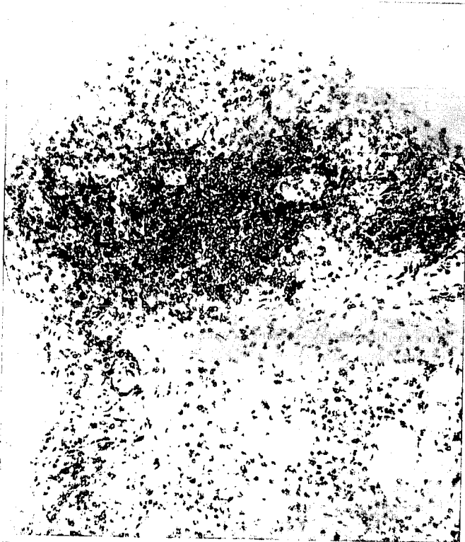
Figure 1. Synovial biopsy of right knee in Patient 2 reveals intense cellular infiltrates stained for CD+ T cells.

The coexistence of these 2 diseases raises questions about pathogenesis, diagnosis, and appropriate management. The first is whether the erosive deforming arthropathy is part of the spectrum of scleroderma. This seems unlikely, due to the clinical, radiological, and immunohistochemical features typical of RA seen in these patients. Further, within this group, 2 distinct subsets of patients with overlapping features of SSc and RA with very different clinical and serologic patterns are described. Optimum management also differs for these subsets — 3 of the 4 patients described were treated as for RA with methotrexate, with a consequent improvement in symptoms and signs of joint inflammation and a fall in markers of inflammation. However, in the other subset of patients, the lcSSc component of the disease appears to be mild and does not require aggressive therapy 2 .