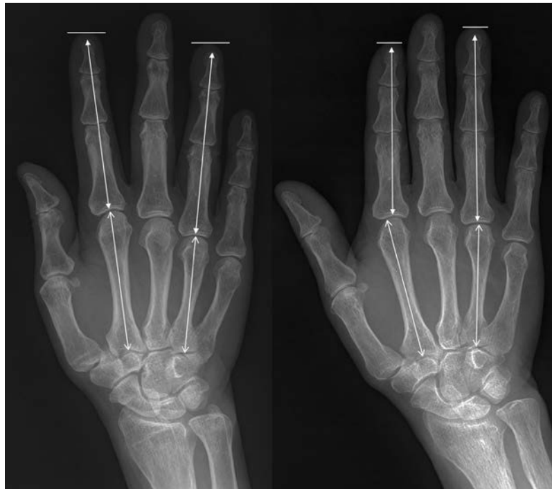
Figure 1. Posteroanterior hand radiographs were used to calculate the index-to-ring finger ratio (IRFR) through radiographic and visual methods. For the radiographic IRFR, the ratio of the length of the second to fourth phalangeal bones and metacarpal bones were measured to obtain phalangeal IRFR and metacarpal IRFR, respectively (arrows). For the visual IRFR, soft tissue outlines of the index fingertip and of the ring finger were compared. Longer ring finger than index finger (right panel), was defined as type 2 IRFR, and index finger longer than or equal to ring finger was defined as type 1 IRFR (left panel).