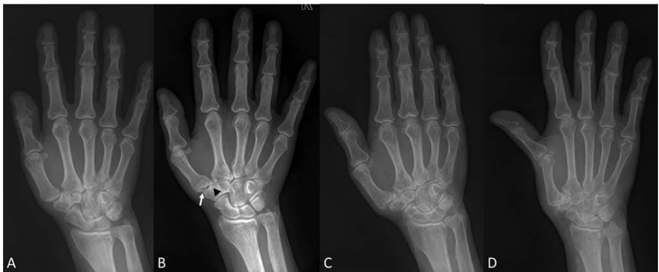
Figure 2. TMCJ OA was evaluated from the posteroanterior hand radiographs according to the Kellgren-Lawrence grading system. (A) Grade 1 was defined to have minimal osteophytes. (B) Grade 2 had definite osteophytes (white arrow) and possible cyst (black arrowhead), and was the cut-off for diagnosis of TMCJ OA. (C) Grade 3 had JSN, subchondral sclerosis, and deformity of bone ends, and was the cut-off for severe TMCJ OA. (D) Grade 4 had large osteophytes, severe sclerosis, and severe JSN. JSN: joint space narrowing; OA: osteoarthritis; TMCJ: trapeziometacarpal joint.

OA, according to the KL grade, demonstrated grade 0 in 181 out of the 604 participants (30.0%), grade 1 in 311 (51.5%), grade 2 in 79 (13.1%), grade 3 in 31 (5.1%), and grade 4 in 2 (0.3%). Overall, we diagnosed TMCJ OA (a KL grade of \geq 2 ) in 18.5% of them (112 out of 604, 62 men and 50 women), and severe