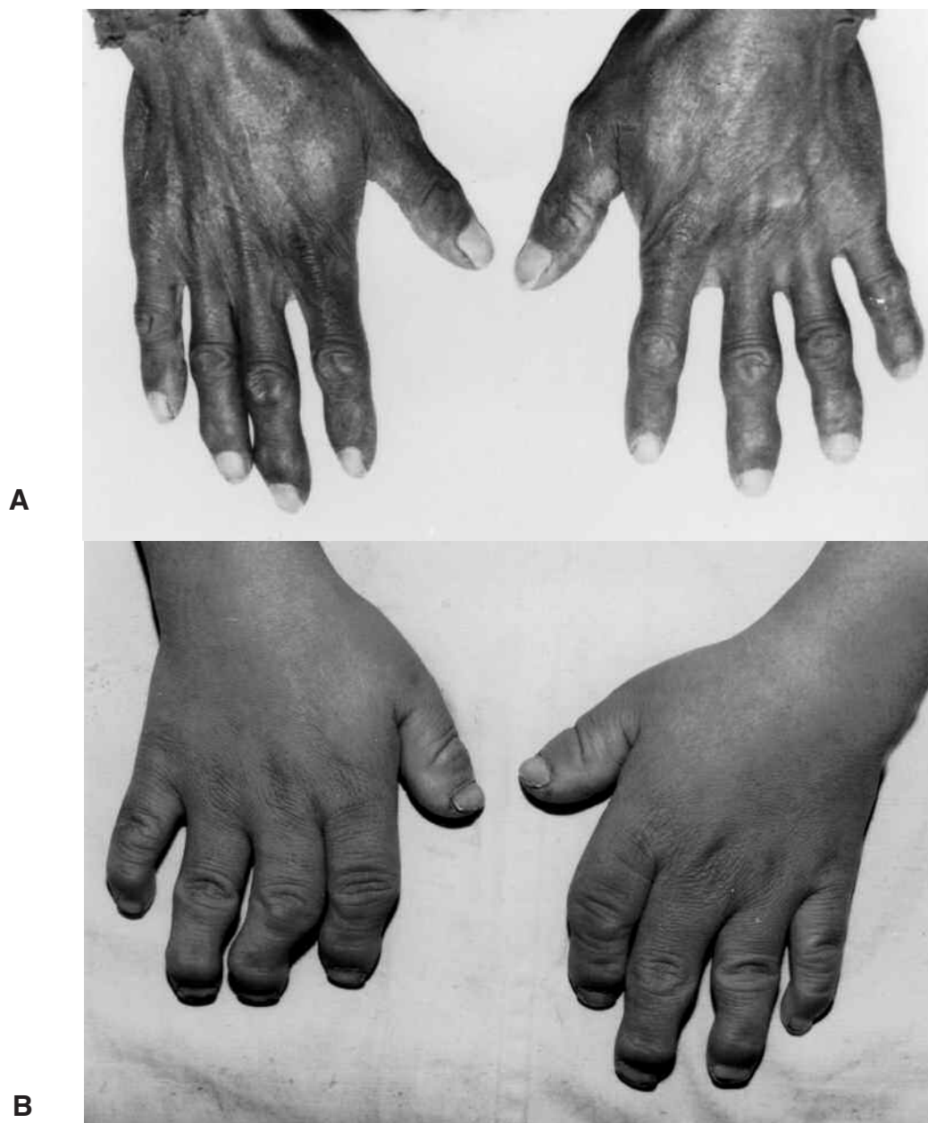
Figure 1. A. An adult patient with Grade 1 KBD; the knuckles are plainly thickened. B. Brachydactyly abnormality of a patient with Grade 2 KBD.

dized products act with dimethylaminobenzaldehyde and show amaranth. The assay was performed as recommended by the manufacturer.