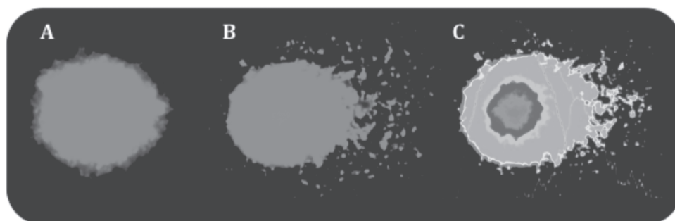
Figure 1. Typical comet assay showing a cell exhibiting no DNA damage (A = score 0) and a cell with moderate DNA damage (B = score 3). The cell exhibiting moderate damage (as shown in B) was submitted to fluorescence analysis (as shown in C), and the magnitude of DNA damage was measured as the percentage of tailed DNA.

The statistical analyses were performed using SigmaStat and GraphPad InStat computer software programs, with the level of significance set at p \leq 0.05 .