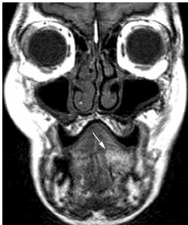
Figure 1B. Coronal T1-weighted image showing fatty change in the left hemi-tongue as evidenced by increased signal in that area (arrow).

J Rheumatol 2009;36:4; doi:10.3899/jrheum.080993