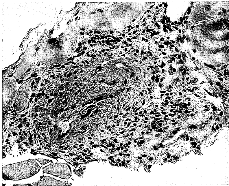
Figure 2. Microscopic findings of CT guided biopsy material from the right m. psoas. A small intramuscular artery with subacute vasculitis is present. There is infiltration of mainly mononuclear and some granulocytes in the vessel wall and the surrounding tissue with signs of necrosis and fibrinous deposits.

One month after the start of treatment abdominal CT scanning showed nearly complete regression of the psoas process, with a few fibrotic strings remaining. At 12 months after diagnosis she was doing well despite some