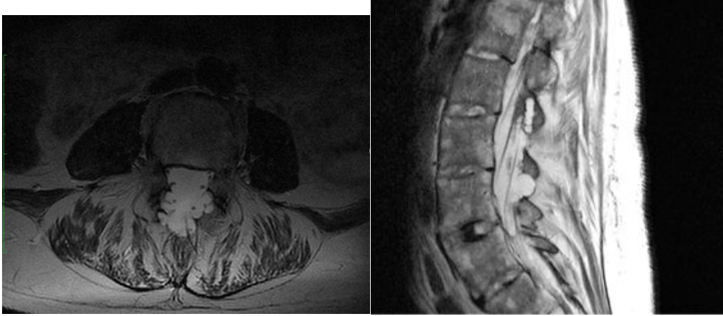
Image 2: Left: T2-Weighted axial scan at the L 4 level in the lumbar spine demonstrating posterior dural ectasia, Right: T-2 weighted sagittal scan of the lumbar spine showing the posterior location of the abnormalities with the normal contour of the anterior spinal canal