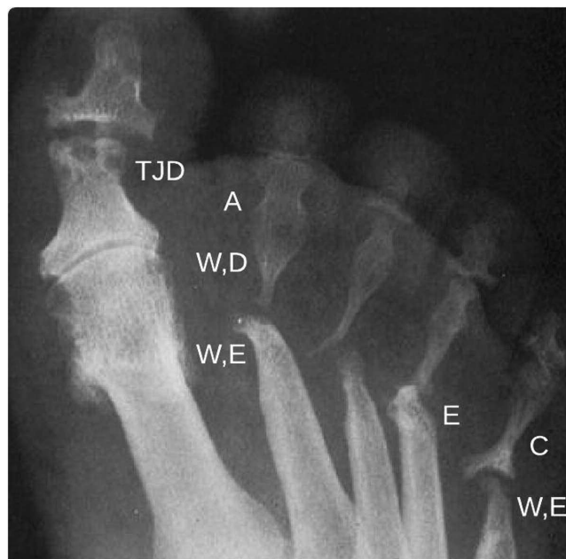
Figure 1. Illustration of radiographic features of PAM. Presence of total erosion at both sides of the joint (marked as TJD). Bone resorption involving of the epiphysal head (marked as E). Bone resorption extending to the diaphysis (marked as D). Presence of bone whittling, resorption of bone causing pinpoint end (marked as W). Presence of pencil-in-cup change, resorption of bone causing cupping of distal or proximal end of the bone with whittling of the opposite side (marked as C). Presence of ankylosis (marked as A). PAM: psoriatic arthritis mutilans.

Analysis. Descriptive statistics were used to aggregate the data without weighting. If the clinical and radiographic features were mentioned in the definition, they would be marked as present; the sum of the total studies reporting the specific items was divided by the total studies reported to calculate the proportion.