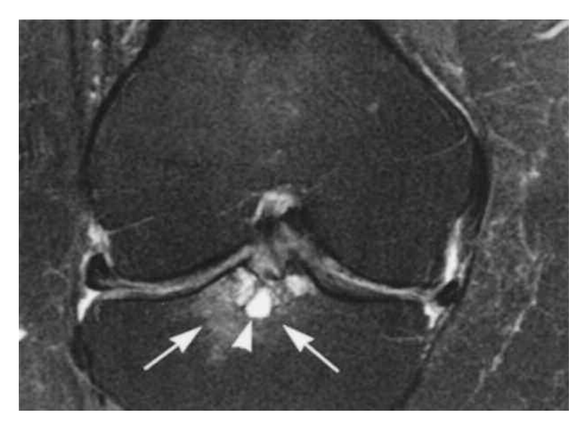
Figure 1 . Femoral notch bone marrow lesion (BML). Coronal proton density-weighted fat-suppressed magnetic resonance imaging (MRI) shows grade 3 WORMS (whole-organ MRI score) subchondral bone marrow lesion at the tibial subspinous region (arrows) with a cystic component (arrowhead). Image shows the BML at the tibial insertion of the anterior cruciate ligament. There is medial and lateral meniscal subluxation and partial maceration of the body of the medial meniscus. There is a diffuse thinning of the cartilage of the central medial femur.

Hand enthesophytes . The hand radiographs were read for enthesophytes by a rheumatologist (NG) trained before the study by musculoskeletal radiologists (AG, PA) in reading enthesophytes on plain hand radiographs. As the first digit does not project well on plain PA radiographs, enthesophytes on only digits 2 through 5 were scored for both hands of each participant. Enthesophytes were scored on a scale of 0 = normal, 1 = mild, 2 = moderate, and 3 = severe at each of the midshafts of the proximal, middle, and distal phalanges and juxtaarticular nonsynovial areas of the metacarpophalangeal