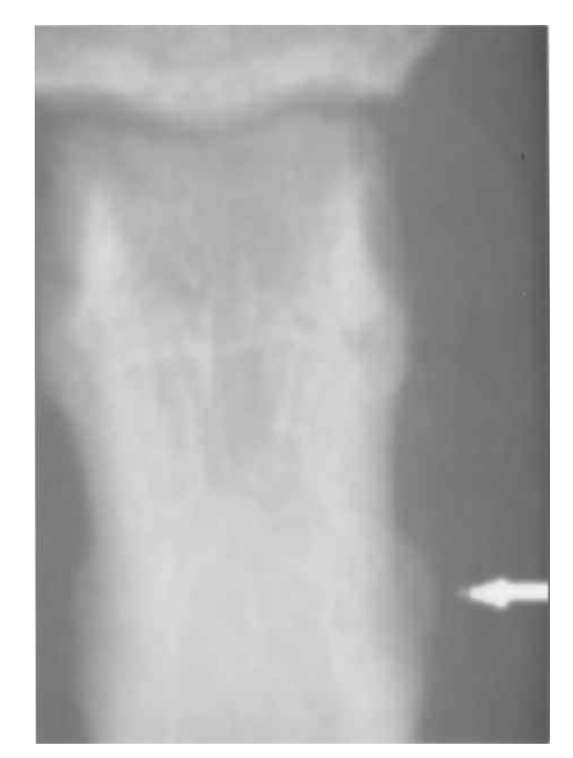
Figure 3. Grade 2 proximal midshaft enthesophyte.