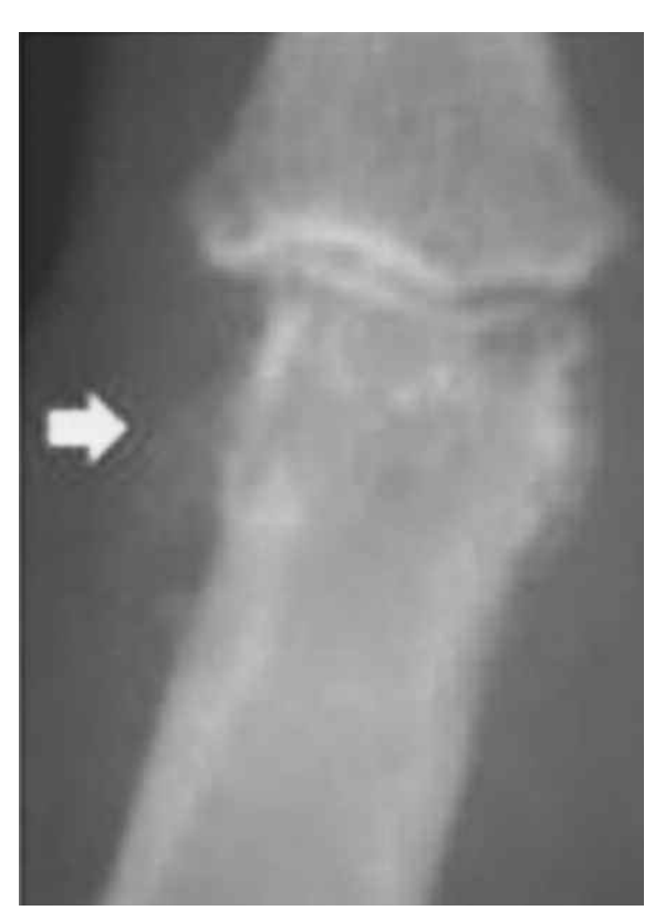
Figure 4. Grade 3 proximal interphalangeal enthesophyte.