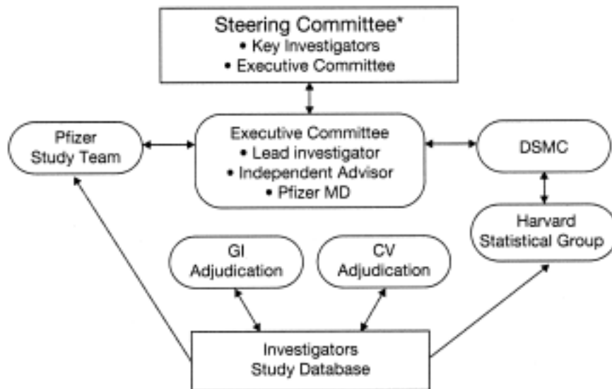
Figure 2. The structure of the study. The GI events adjudication committees consisted of gastroenterologists recognized for their expertise. *CONDOR study only. DSMC: Data Safety Monitoring Committee; GI: gastrointestinal; CV: cardiovascular.