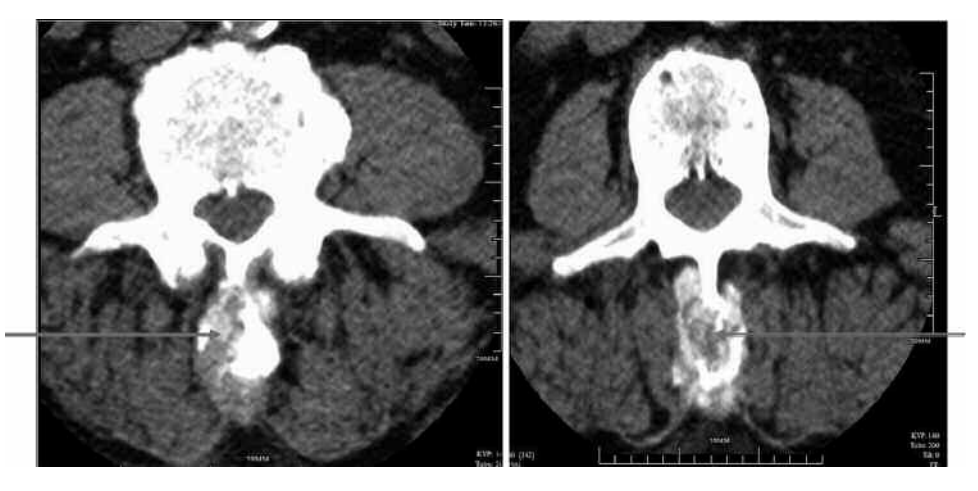
Figure 2. Spinous process with tophus: 2 views of the same patient.