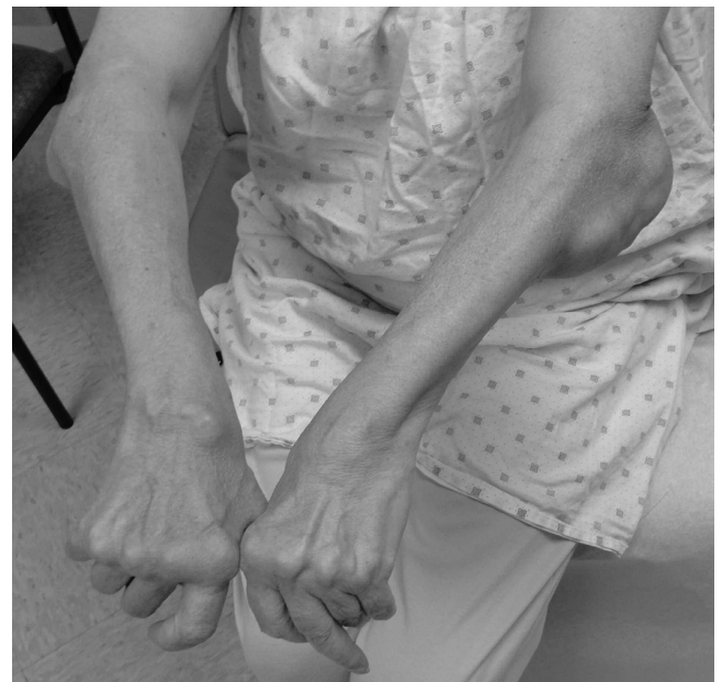
Figure 2. Examination of the extremities revealed evidence of chronic, severe rheumatoid arthritis, including ulnar deviation, large subcutaneous nodules overlying the elbows, and skeletal deformities of the metacarpophalangeal joints of the hands.