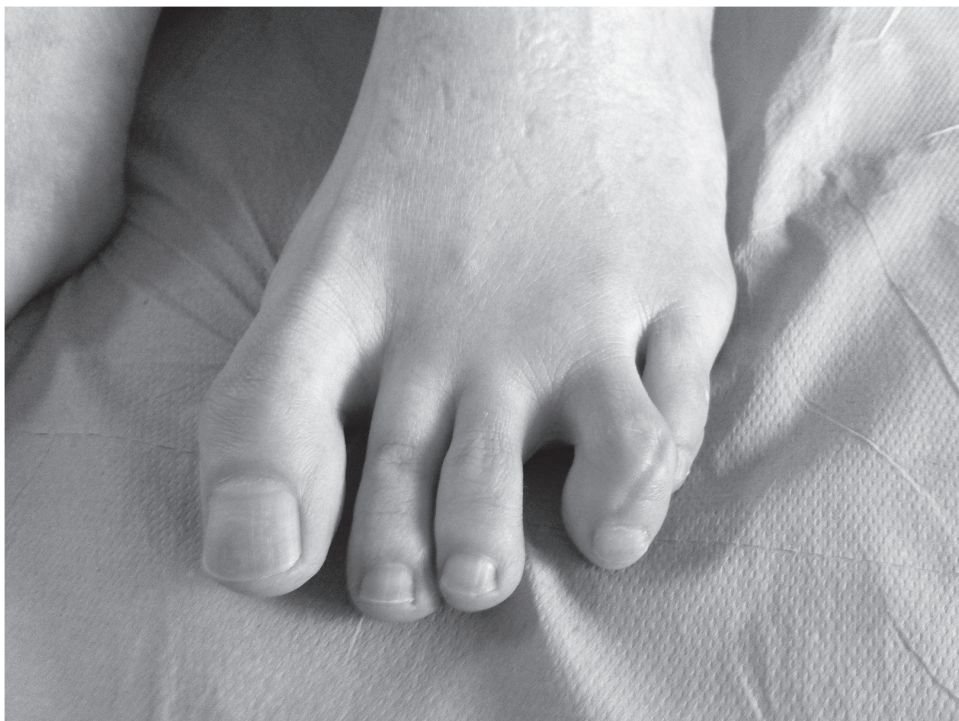
Figure 1. The patient presented with painful spacing of the third and fourth toes of the left foot.