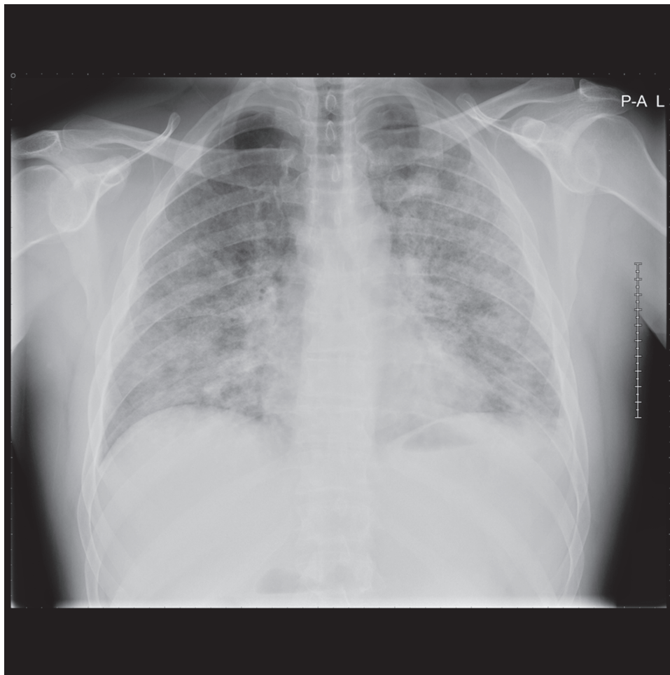
Figure 2. Radiograph the day after admission, showing extensive bilateral alveolar consolidations.