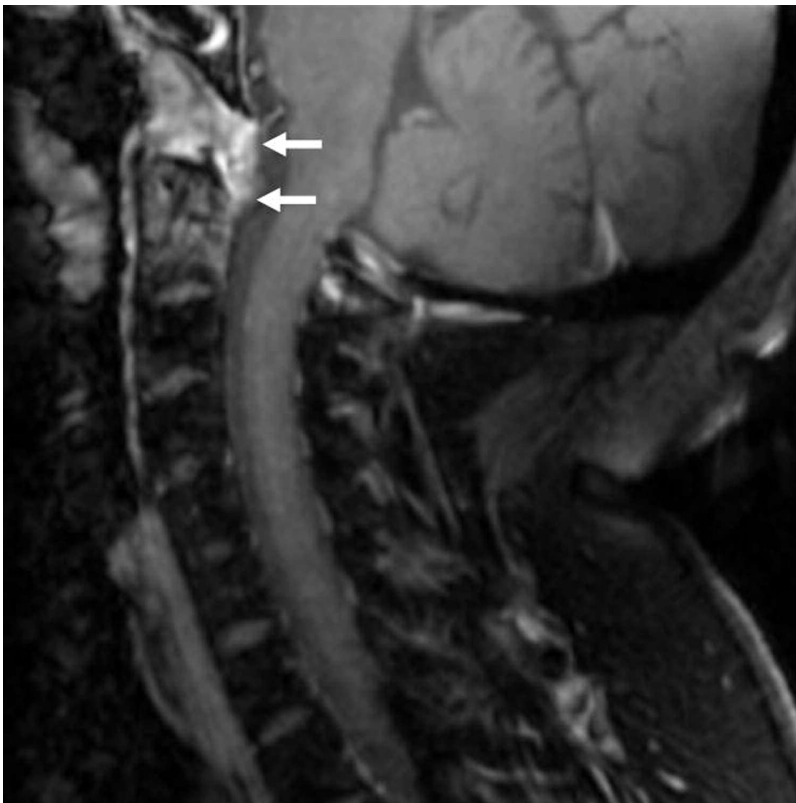
Figure 1. Sagittal T1-weighted MRI demonstrated severe synovitis in the atlantoaxial joint (white arrows). MRI: magnetic resonance imaging.

The patient was initially treated with prednisone 1 mg/kg/day and adalimumab 40 mg every 14 days. After 2 weeks, prednisone was tapered off. There was an improvement on the baseline Bath Ankylosing Spondylitis Activity Index from 4.5 to 1.1 when assessed 12 weeks later. Symptoms such as dysphagia and dysphonia were resolved. Another MRI was performed demonstrating the regression of the synovitis. Because there was no atlantoaxial sublux-