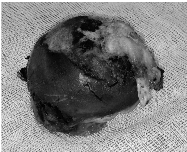
Figure 1. Osteotomy of the femoral neck revealed dark brown pigmentation of the cartilage of the femoral head.

Histology of intracapsular tissue performed intraoperatively showed no signs of local infection. The femoral neck was osteotomized (Figure 1) and THA was performed successfully. Postoperative clinical examination showed hyperpigmentation of the sclerae (Figure 2) and ear cartilage. Family history revealed that her late brother had also had hyperpigmentation of the sclerae and ear cartilage. Alkaptonuria was diagnosed in the urine sample by mass spectroscopy, which showed increased levels of homogentisic acid.