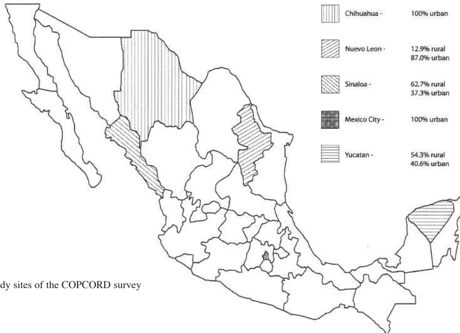
Figure 1. Study sites of the COPCORD survey in Mexico.