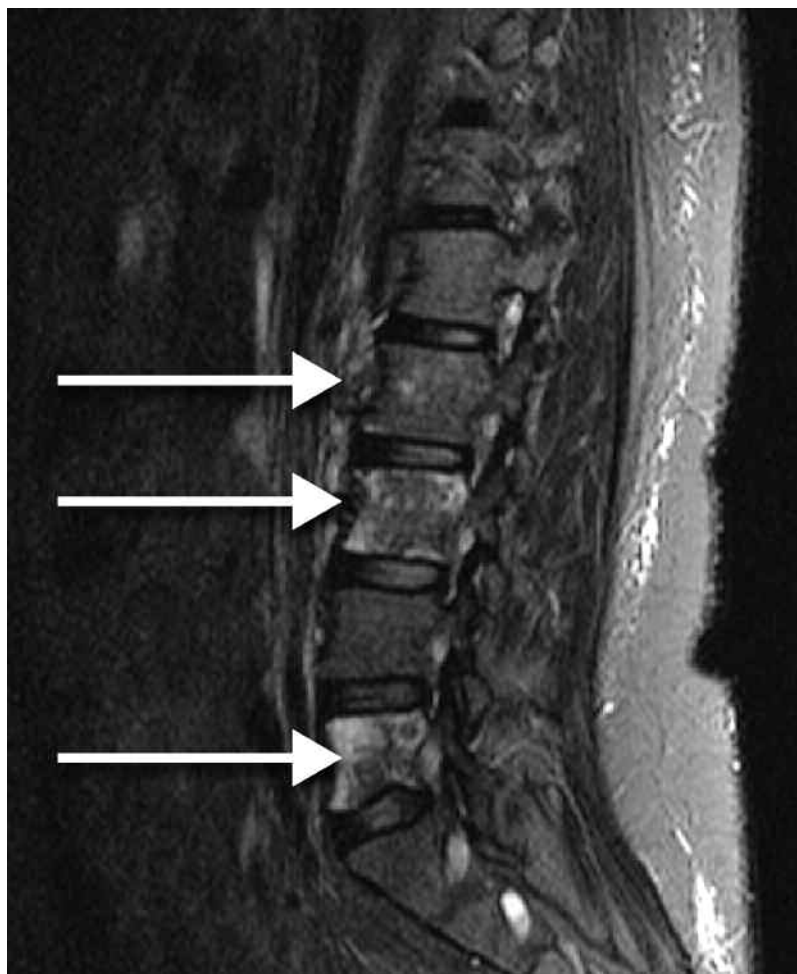
Figure 1. Magnetic resonance imaging of the lumbar spine showed decreased enhancement at L2, L3, and L5 (arrows).

Pulmonary specialists were consulted because of her new chest radiograph findings and deteriorating clinical condition. Cardiogenic pulmonary edema was unlikely given the lack of examination findings consistent with heart failure syndrome and a normal transthoracic echocardiogram. The primary concerns were the acute respiratory distress syndrome and intraalveolar hemorrhage, the latter primarily because of the patient's severe thrombocytopenia. Bronchoscopy was performed and revealed no