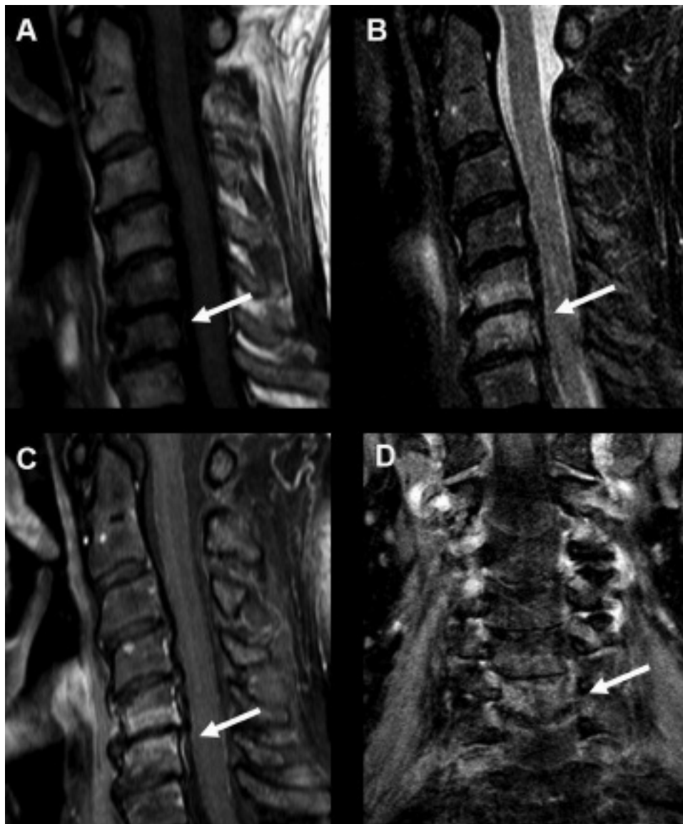
Figure 1. A. Sagittal T1-weighted image. B. Sagittal short-tau inversion recovery image. C. Sagittal T1-weighted postcontrast image. D. Coronal VIBE (volumetric interpolated breath-hold examination) image. Note bone marrow edema at C5 and C6 (arrows).

than if the vertebral bodies were semiquantitatively scored 0–3 (ICC = 0.67). The ICC for synovitis and erosions was moderate at 0.57 for both.