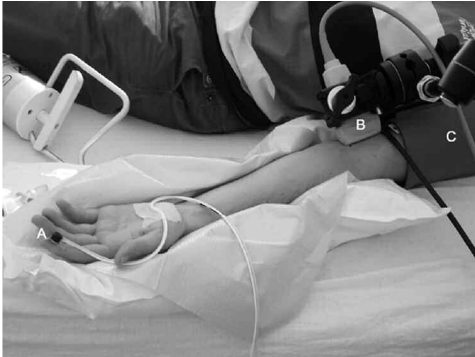
Figure 1. Simultaneous recording of digital skin microvascular and brachial artery macrovascular hyperemia after a 5-minute occlusion of the brachial artery. A: Laser Doppler probe; B: ultrasonography probe; C: pressure cuff.