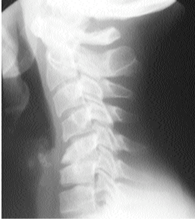
Figure 2. Cervical spine radiograph shows pear-shaped dysplasia of C5, platyspondyly, and kyphosis.

ease for 38 years 9 , and a mild form of Morquio A disease with bilateral Perthes disease was recognized only when the patient reached adulthood 10 .