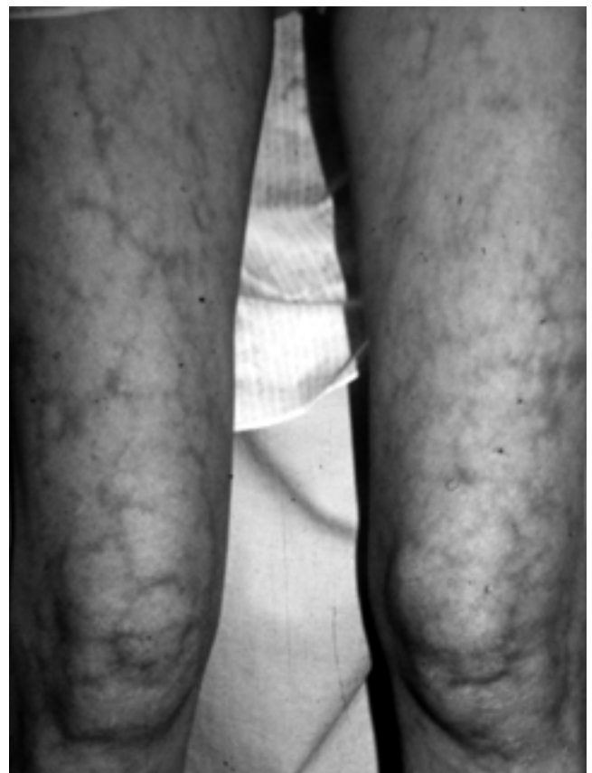
Figure 1. Livedo reticularis in a patient with antiphospholipid (Hughes) syndrome.

When asked their opinion, the students attending our clinics stated that evidence for APS was not convincing: "no history of thromboembolic disease," "no history of multiple miscarriages," "cardiolipin antibodies negative." Clearly, in their view, "Hughes syndrome" sounded more like the patient's own name rather than the antiphospholipid (Hughes) syndrome. Confusion remained: did she describe "Mrs. Hughes syndrome," a carefully built pathomimic simulation, or a true Hughes syndrome? Extensive and fixed livedo reticularis of lower limbs (Figure 1) and lupus anticoagulant positive on 2 previous occasions clarified the diagnosis. There was little