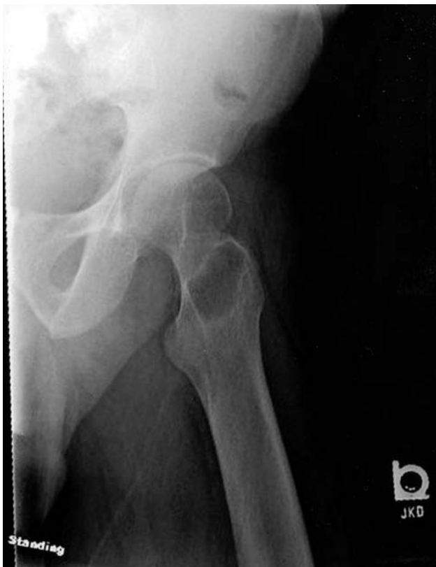
Figure 2. Radiograph of the left hip shows the large lesion within the neck of the femur to be sharply marginated with a mildly sclerotic border and a narrow zone of transition.

5). Histology of the mass within the femoral neck showed areas consistent with rheumatoid nodule formation, with fibrinoid necrosis and surrounding inflammatory cells, as well as areas of synovial tissue with chronic synovitis (Figure 6). Gross pathology revealed synovial hyperplasia, with the exterior bone surface showing no eburnation or osteophytes. The interior aspect of the femoral neck leading into the femoral head had a hollow, shelled-out, smooth-