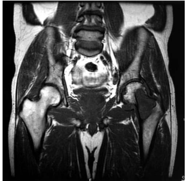
Figure 3. Coronal MRI of the pelvis shows a large lesion of the left femoral neck and head with uniform intermediate signal (coronal noncontrast T1 weighted image; TR/TE 500/9; 512 × 512; 1 NEX; 1.5 Tesla).

5). Histology of the mass within the femoral neck showed areas consistent with rheumatoid nodule formation, with fibrinoid necrosis and surrounding inflammatory cells, as well as areas of synovial tissue with chronic synovitis (Figure 6). Gross pathology revealed synovial hyperplasia, with the exterior bone surface showing no eburnation or osteophytes. The interior aspect of the femoral neck leading into the femoral head had a hollow, shelled-out, smooth-