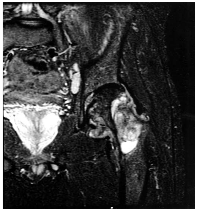
Figure 4. Coronal MRI of the left hip shows the lesion to be internally complex in the femoral neck and head with violation of the cortex (coronal non-contrast STIR image; TR/TI/TE 3717/140/42; 512 × 512; 2 NEX; 1.5 Tesla).

lined cystic area that measured 3.5 × 2.8 × 2.0 cm. He had an uneventful recovery and was discharged home.