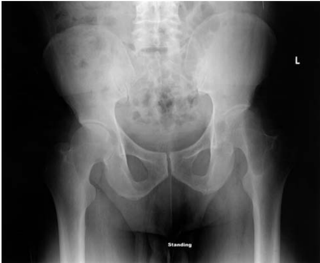
Figure 1. Radiograph of the pelvis shows the sharply marginated left femoral neck lesion without sclerotic margins.