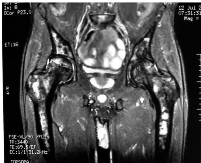
Figure 1. Coronal fat-saturated T2-weighted MR image of Patient 1 showing heterogeneous signal of bone marrow of femurs and iliac bones, and avascular necrosis of both heads of femurs.

a 3-year long history of asthenia, anorexia, weight loss, sweats and fever, epigastric pain, and deep bone pain in both legs. Examination revealed large volume ascites. She complained of symmetrical permanent pain in both thighs and lower legs. There was no arthritis or amyotrophy, and neurological examination was otherwise normal. Hemoglobin was 8.3 g/dl; white cell and platelet counts were normal. Creatinine clearance was 28 ml/min, CRP was 26 mg/l, and serum ferritin was 830 ng/ml. Liver biological tests and lactate dehydrogenase levels were within normal range. Plasma chitotriosidase levels were 46 times the upper value. Serum protein electrophoresis showed low gammaglobulins and a monoclonal spike measured in the betaglobulins at 1400 mg/dl, identified as IgA kappa on immunoelectrophoresis. Twenty-four hour urine collection contained 1.8 g protein, including a monoclonal spike of IgA kappa. Paracentesis was performed and peritoneal fluid analysis showed 4.4 g/dl protein content, low triglyceride levels, and 130 cells/ml (61% macrophages, 24% neutrophils, 10% lymphocytes) with no malignant cells, microorganisms, or mycobacteria. A monoclonal IgA kappa spike was also found in the peritoneal fluid.