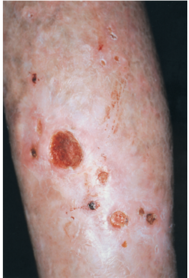
Figure 1. Bullous pemphigoid causing multiple ulcerations in the sclerotic skin on the extremity of a patient with scleroderma.

Although a case of a 73-year-old woman with generalized morphea who developed bullous pemphigoid after receiving whole-body UVA-1 phototherapy is reported 1 , the coexistent systemic sclerosis (scleroderma) with bullous pemphigoid is not described in the literature.