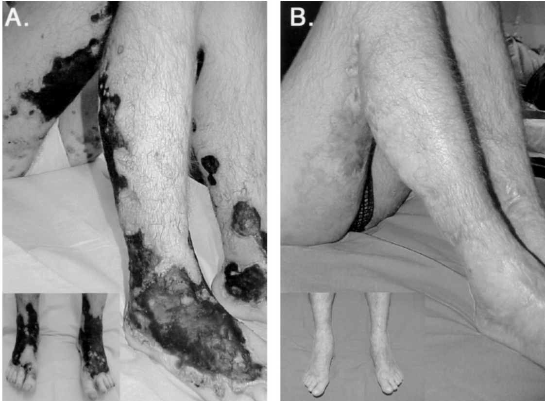
Figure 1. Cutaneous necrosis on the lower extremities on admission (A), which healed after 6-month treatment with scarring and slight discoloration (B).

ment 6 . Differential diagnosis included other autoimmune diseases with common skin manifestations: polyarteritis nodosa, microscopic polyangiitis, cutaneous leukocytoclastic vasculitis, giant cell arteritis, and angiocentric lymphomas, along with diseases referred to as ANCA-associated vasculitis (microscopic polyangiitis, Churg-Strauss vasculitis, necrotizing pauci-immune glomerulonephritis) 7 . Our patient fulfilled clinical and laboratory criteria for the diagnosis of WG, supported by a good response to cyclophosphamide 8 . Further, absence of the necrotic core and violaceous border speak against pyoderma gangrenosum. The patient did not receive coumarins, a potential cause of skin necrosis.