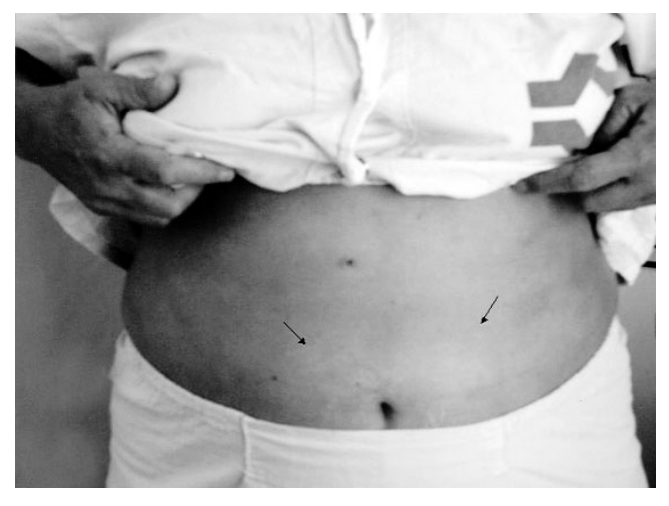
Figure 2. An erythemic induration over the lower abdomen.