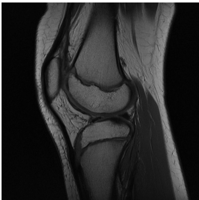
Figure 2. Patient 19: left knee aspirated, washed out, and injected with steroids on 17 occasions. On 12 occasions, bleeding had occurred within the joint. On 5 occasions, the aspirate was inflammatory fluid, suggesting a degree of ongoing synovitis. Despite this, at 11 years of age, the patient's knee remained functionally near normal without pain and with comparatively few MRI changes, but with some chondral damage. MRI: magnetic resonance imaging.

In infants with severe hemophilia who do not receive prophylactic factor replacement, 44% experience their first joint bleeds in the first year of life 2 with a median age of first joint bleeding at 17 months. Ninety percent will have had spontaneous joint bleeding by 27 months. With “on demand” factor replacement therapy, > 90% of adolescents with severe hemophilia A have joint damage by 16 years with evidence of arthropathy appearing early. It is expected that by the third decade, many will have 1 severely affected joint, 2 moderately affected joints, and many deteriorating joints. Immediately upon bleeding into the joint, there is an acute inflammatory reaction manifested by an initial influx of neutrophils. Later, there is an influx of monocytes/macrophages that secrete damaging cytokines and thereby initiate the longterm cycle of inflammation and irreversible damage within the joints 13 . Intervening before this occurs would seem ideal. We speculate that with early intervention (aspiration and IA steroids), the acute inflammatory reaction is halted and the establishment of the longterm cycle of inflammation is prevented.