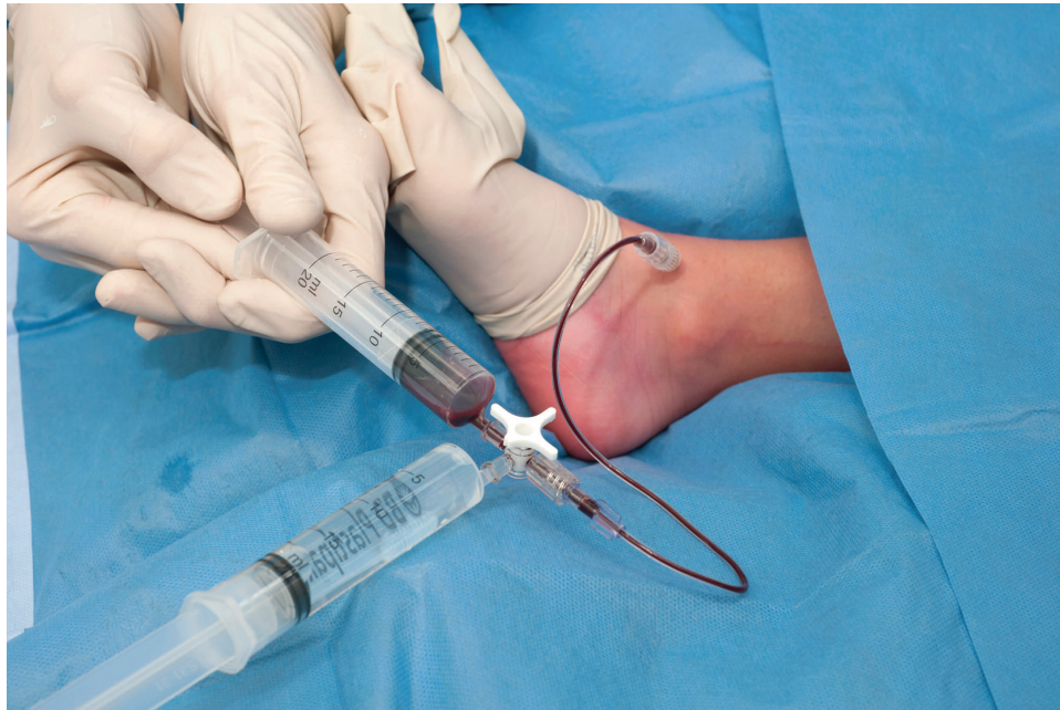
Figure 1. The Western Australia protocol of joint aspiration. Note the extension tubing and 3-way tap to avoid manipulation of the needle.