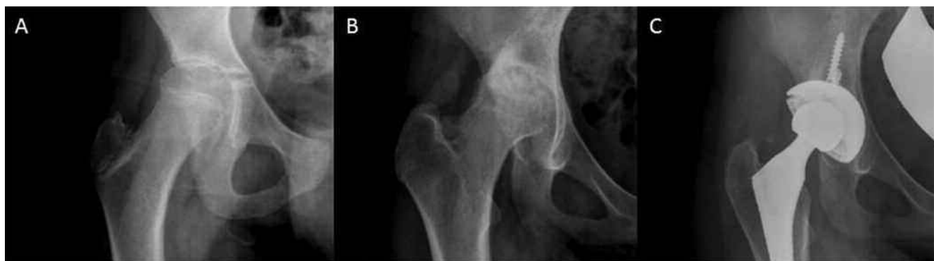
Figure 2. Serial radiographs of a 16-year-old patient with systemic JIA who first developed evidence of bilateral clinical hip disease 2 months after presentation. She initially presented at 8 years of age with polyarthritis. Radiographic evidence of hip damage appeared 3 years later with joint space narrowing and acetabular sclerosis (A). Progressive joint space narrowing with marked femoral head erosions with avascular necrosis and acetabular sclerosis was seen 6 years after presentation (B). She required a total hip replacement 1 year later for ongoing significant pain (C).

Corticosteroid use was found not to be predictive for the development of clinical hip disease or radiographic hip