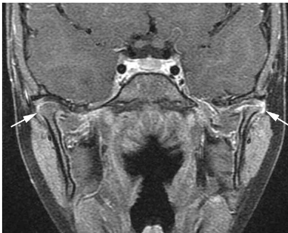
Figure 2. Magnetic resonance image of temporomandibular region of a 5-year-old girl 2 years after diagnosis of polyarticular RF-negative JIA. With no previous symptoms of TMJ arthritis, she was found to have mandibular asymmetry with growth delay on the left side. MRI revealed severe destruction of the left condylar head and bilateral synovial contrast enhancement (arrows).

Some studies have reported a higher rate for TMJ