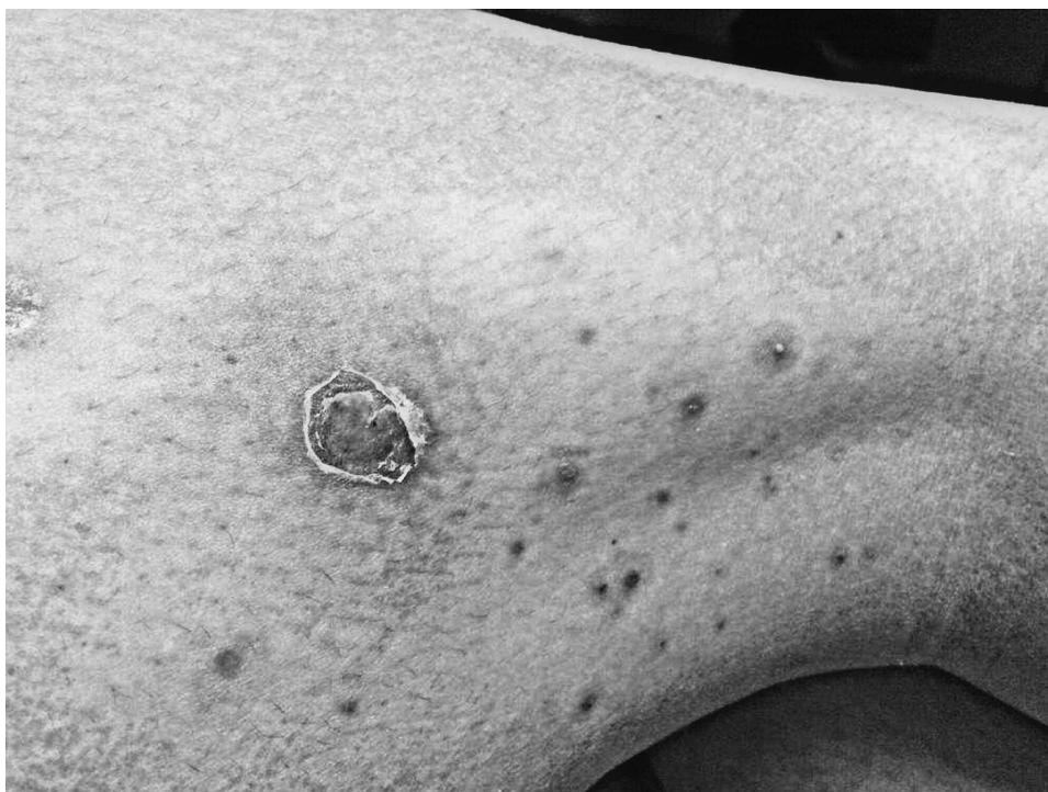
Figure 1. Multiple erythematous pustules and nodules on the right leg.