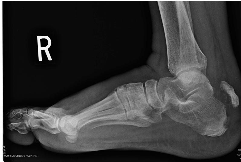
Figure 2. Right ankle radiograph with a displaced fracture of the posterior calcaneus and soft tissue swelling.

sensory neuropathy. Though there was subjective improvement with IVIG therapy in this patient, repeat NCS showed progression of the neuropathy and the patient developed a second Charcot joint. Monitoring of patients for the development of neurological manifestations is warranted because some patients may benefit from therapy. Further studies are necessary to determine the optimal treatment and treatment duration for patients with SS-associated sensory neuropathies.