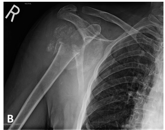
Figure 1. Right shoulder radiograph (A) 3 months prior to presentation with onset of decreased function and (B) at presentation.

The patient was diagnosed with Charcot arthropathy of the shoulder resulting from sensory neuropathy because of primary SS. Treatment was initiated with hydroxychloroquine, low-dose prednisone, and 2 g/kg of monthly intravenous immunoglobulin (IVIG). She had subjective improvement in her right leg paresthesias as well as in arthralgias and fatigue, but no improvement in the right arm. Repeat NCS 1 year later revealed ongoing sensory neuropathy in both hands. After a total of 20 months of IVIG therapy, a third NCS showed ongoing sensory neuropathy with worsening of the left radial sensory response. The patient then presented with painless left foot swelling and was found to have an atraumatic, posterior calcaneal fracture suspicious for a Charcot joint about 2 years after treatment was initiated (Figure 2).