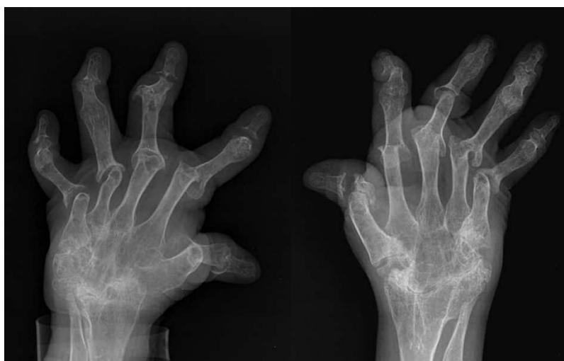
Figure 1. Radiographs of both hands showing severe rheumatoid arthritis affecting both wrists and hands. The deformity limits the movement of multiple joints in both hands.