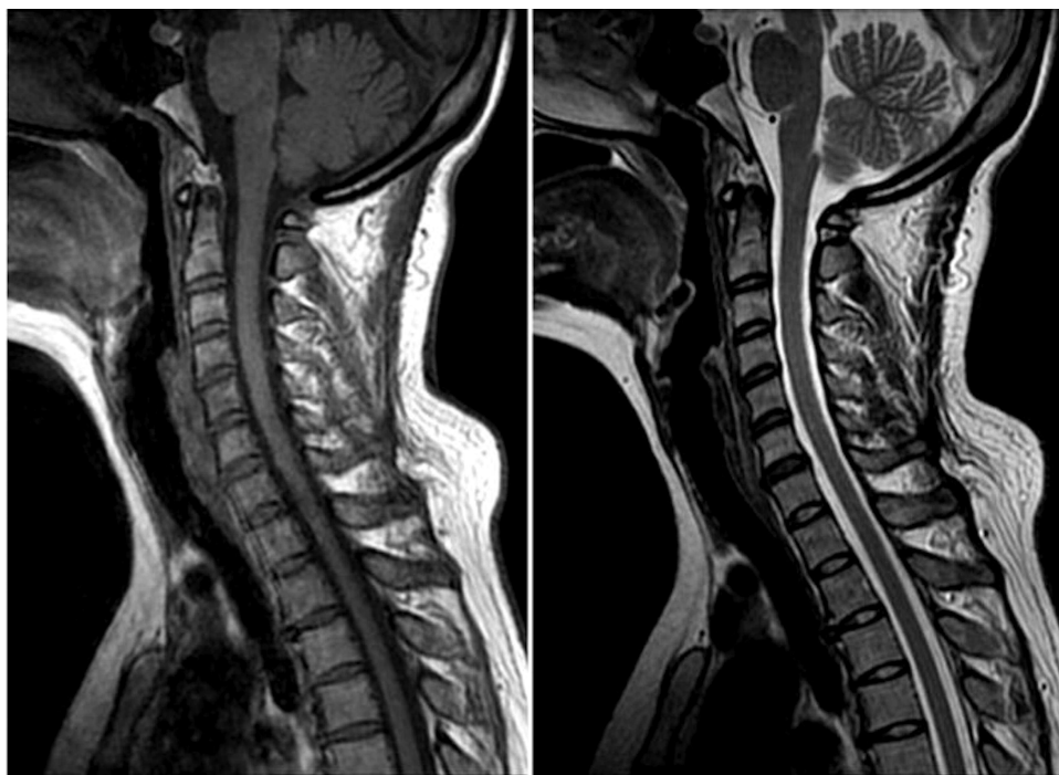
Figure 1. T1-weighted MRI sequences of cervical spine (left) and T2-weighted image of cervical spine (right) show neither atlantoaxial subluxation nor epidural abscess. MRI: magnetic resonance imaging.