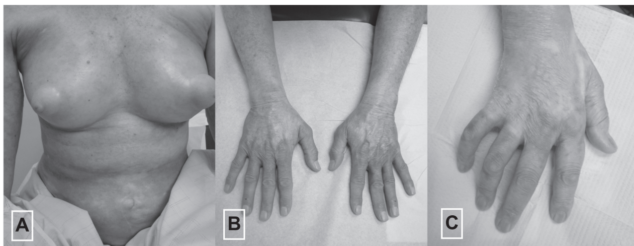
Figure 1. Pansclerotic morphea showing extensive body surface area involvement (A) with distinct lesion features such as abrupt cutoff at the metacarpophalangeal joints (B, C).

Prior reports indicate patients with pansclerotic morphea are at an increased risk for SCC. We observed 2 patients in the pansclerotic group who had SCC, but both were over 60 years of age with fair skin, and both already had a history of SCC preceding the onset of morphea. This picture is further complicated by the use of immunosuppressive agents in both cases, which are also known to increase the risk of SCC 20 . The literature suggests a more delayed onset of SCC