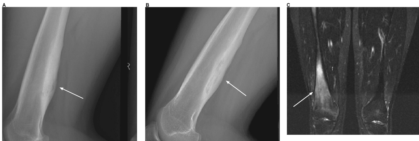
Figure 2. Images of chronic nonbacterial osteomyelitis of the femur in a child with previous juvenile dermatomyositis. Radiographs at (A) 10 and (B) 17 years of age showed posterior femoral lucencies and periosteal new bone formation. Coronal image of both femurs from total body magnetic resonance imaging (C) performed with inversion recovery sequences at 17 years of age. There is diffuse high signal of the distal right femur with associated low signal cortical thickening (courtesy of Dr. M. Ranson). White arrows show the affected bone area.