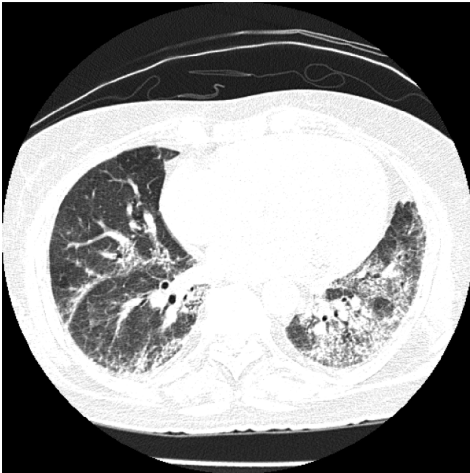
Figure 2. Chest thin slice computed tomography detected ground-glass opacities and signs of fibrosis.

speculative whether the same applies for patients with anti-PL-7 antibodies. Our case suggests that the combination of cyclosporine and corticosteroid with high-dose acetylcysteine may have contributed to control of progression of ILD but not of PH.