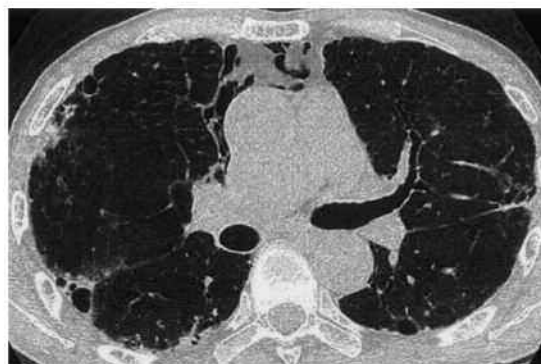
Figure 2. Time course of changes in chest HRCT findings. Azathioprine (AZA) was readministered beginning with a 50 mg/day dose from the 43rd hospital day, after which an infiltrative shadow and ground-glass opacities reappeared in the subpleural regions of the left upper and right upper and middle lobes (2a). Discontinuation of AZA again resulted in improvement of the pulmonary shadows (2b).

tional AZA administration resulted in the reexacerbation of the pulmonary shadow. Based on this, a diagnosis of AZA-induced IP was made, ruling out the acute exacerbation of RA-IP.