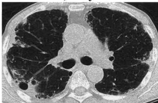
2a; Day 43